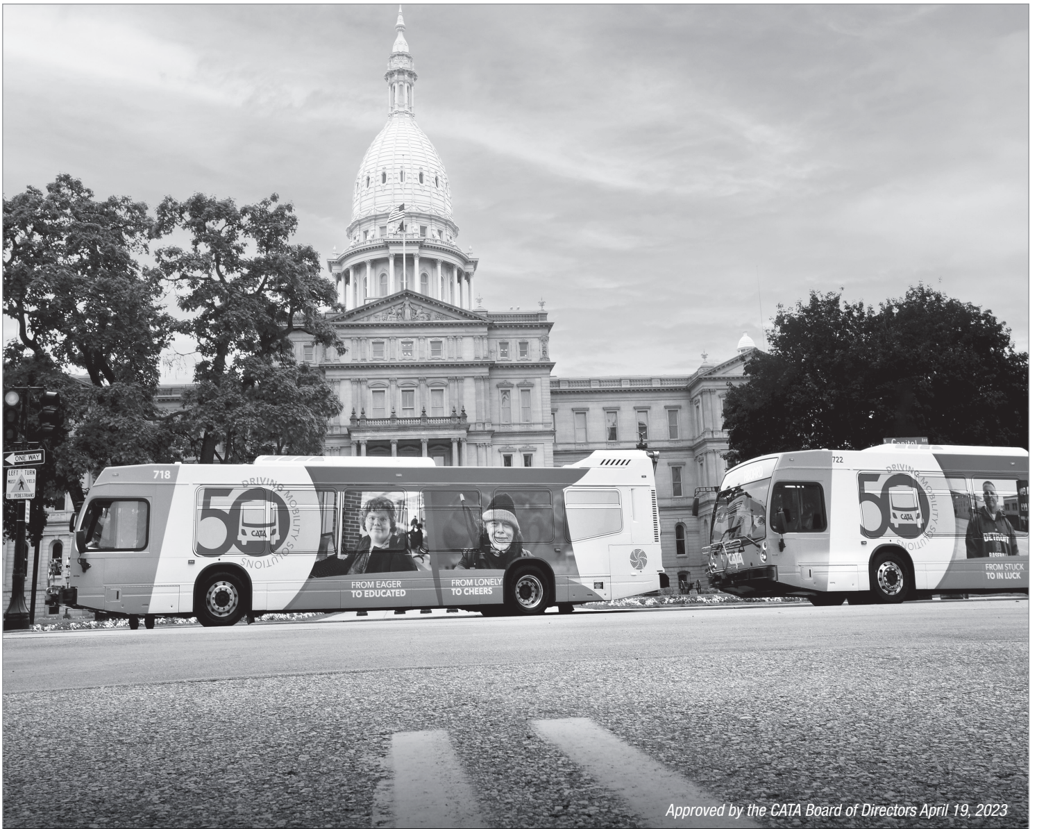
Approved by the CATA Board of Directors April 19, 2023