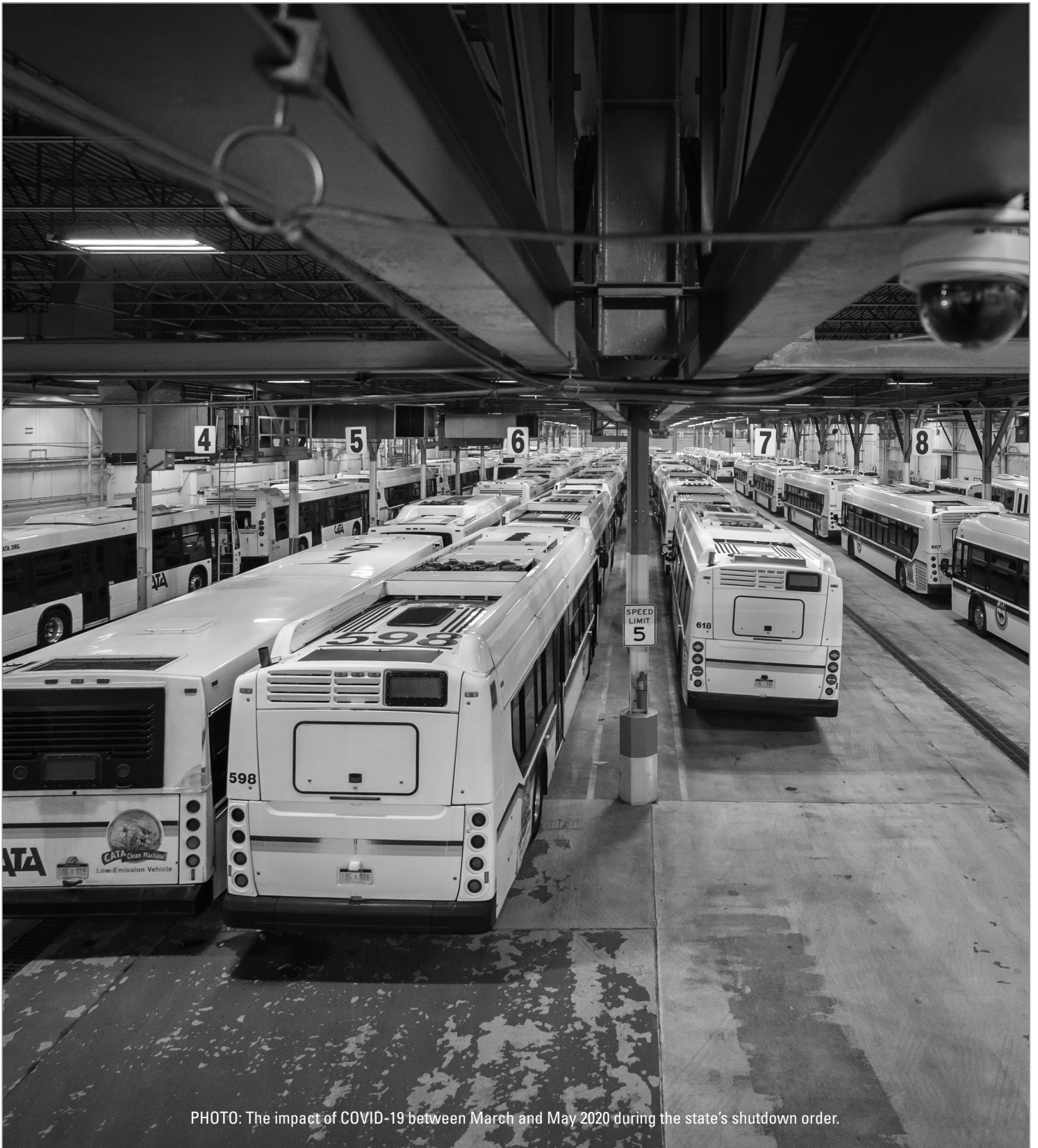
PHOTO: The impact of COVID-19 between March and May 2020 during the state's shutdown order.