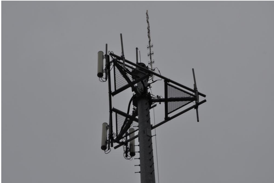
CATA Top antenna – 140'