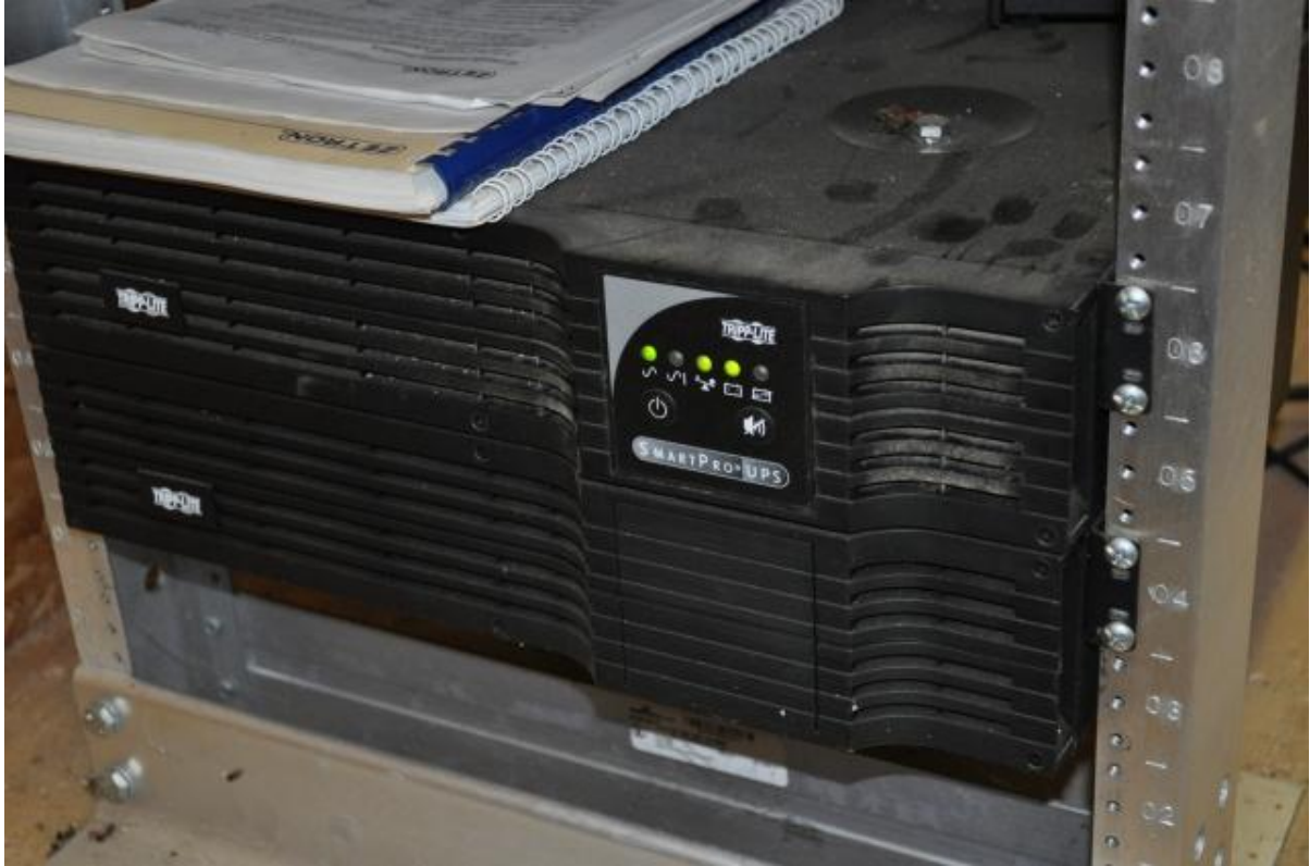
CATA System UPS