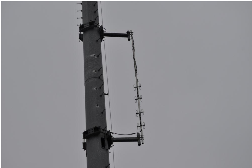
CATA Lower antenna – 70'

Note: This antenna was lowered to around 50 in attempt to provide more space between antenna and sidearm mount.