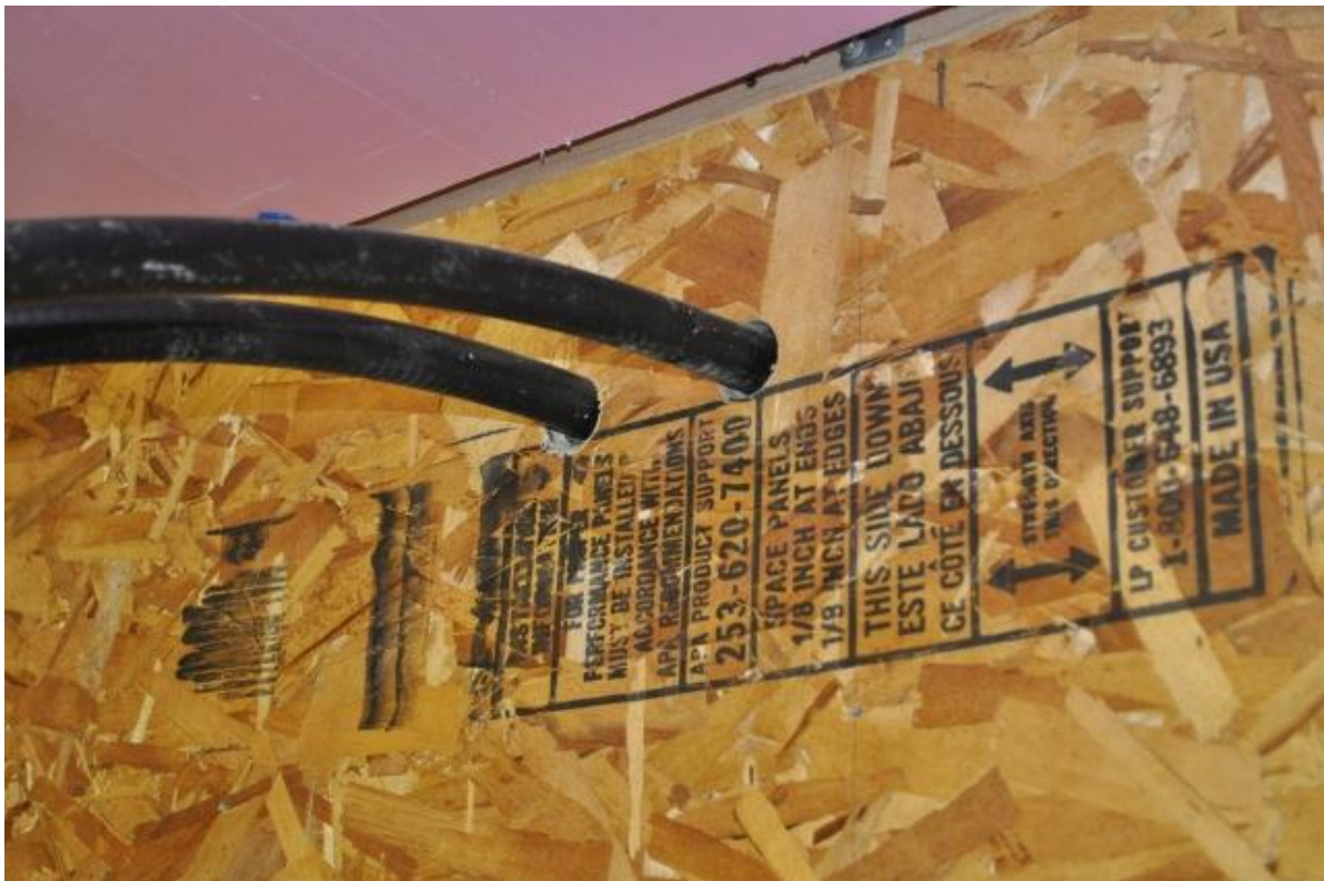
Transmitter Building Transmission Line Entry Point