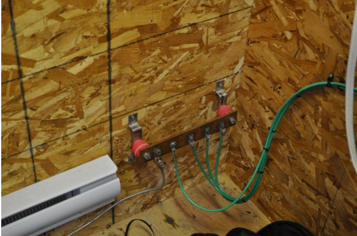
Transmitter Building Ground Bar